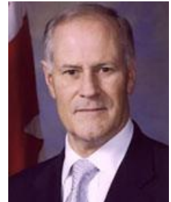
The Honourable Bill Graham Honourary Chair Toronto East General Hospital Foundation Campaign Cabinet

“With the completion of our $60 million campaign, the hospital’s vision for the future is at hand. The highly-anticipated Ken and Marilyn Thomson Patient Care Centre will usher in a whole new era in patient-centred health care. Thank you to our dedicated volunteers and magnificent donors.”